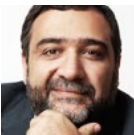
Ruben Vardanian, Advisor to the Chairman of the Board and CEO, Sberbank of Russia. Partner-Founder of the Moscow School of Management SKOLKOVO

(as part of the cross-modular Personal Growth master class)